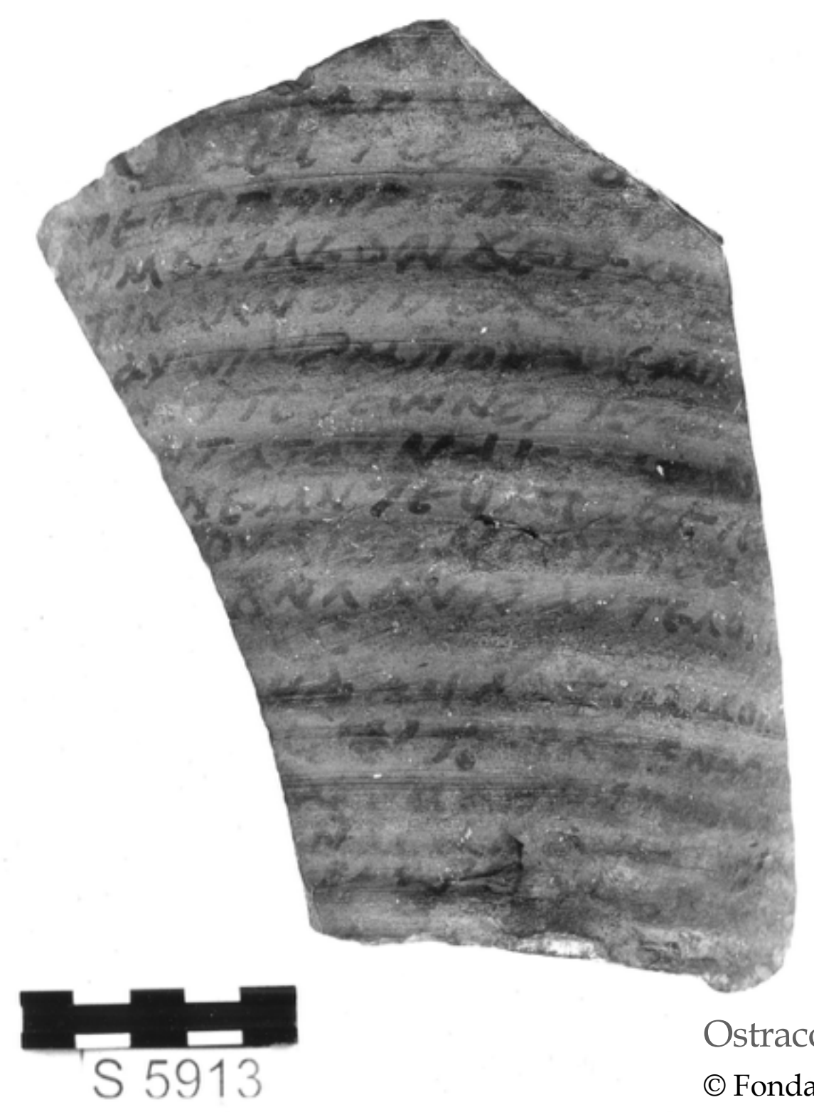
Ostracon Torino S. 5913